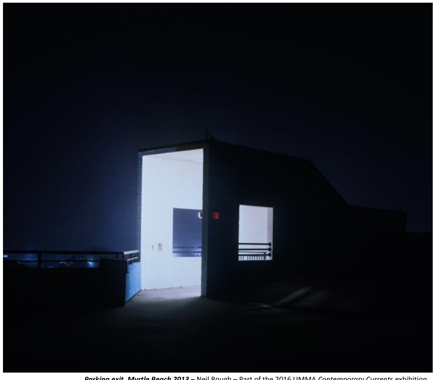
Parking exit, Myrtle Beach 2013 – Neil Rough – Part of the 2016 UMMA Contemporary Currents exhibition