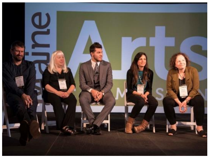
Top: MICA postcard. Middle : Bourassa Dance Company . Bottom: Idea Lab panel discussion.