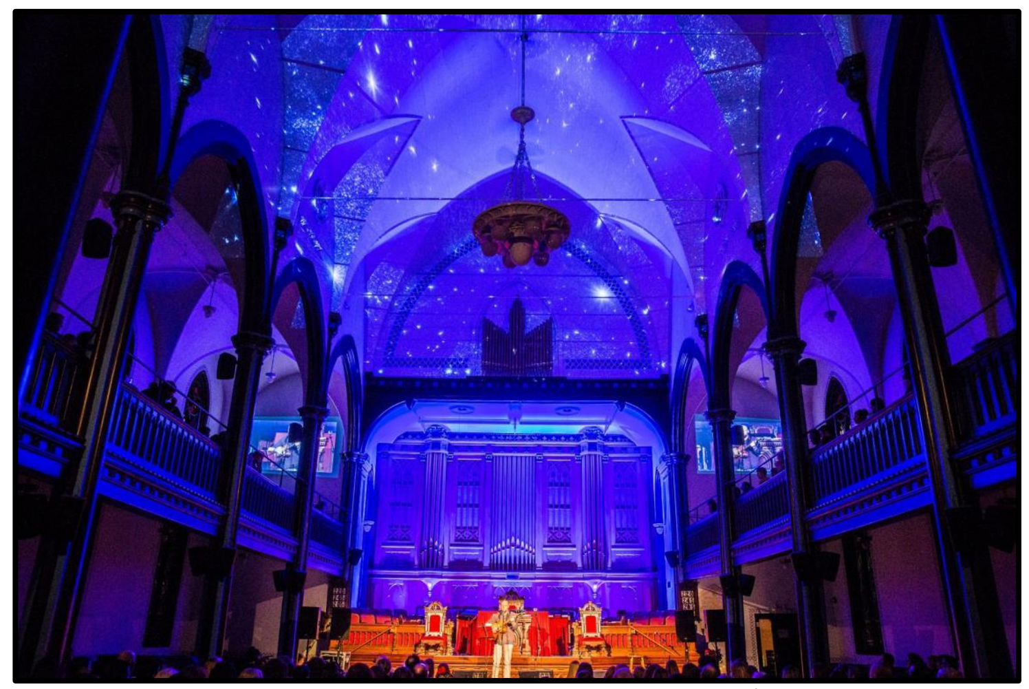
Shivering Songs Festival

Task Force projects range from endeavors that engage all members, to individual members working with other members on particular ventures, to members working individually or collectively with organizations to promote cultural exchange.