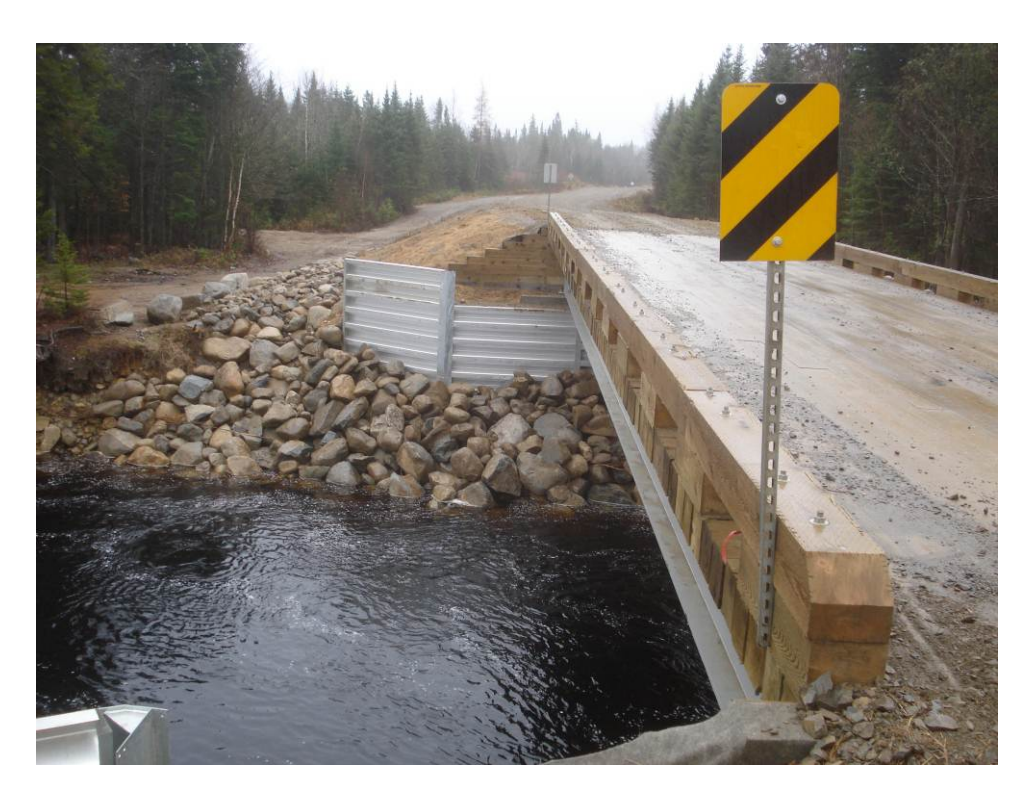
Photo 8.15.3 New single-span, single-lane bridge at Nashwaak River.

Photo 8.15.2 Fire Road, near the intersection with Napadogan Road, looking eastward.