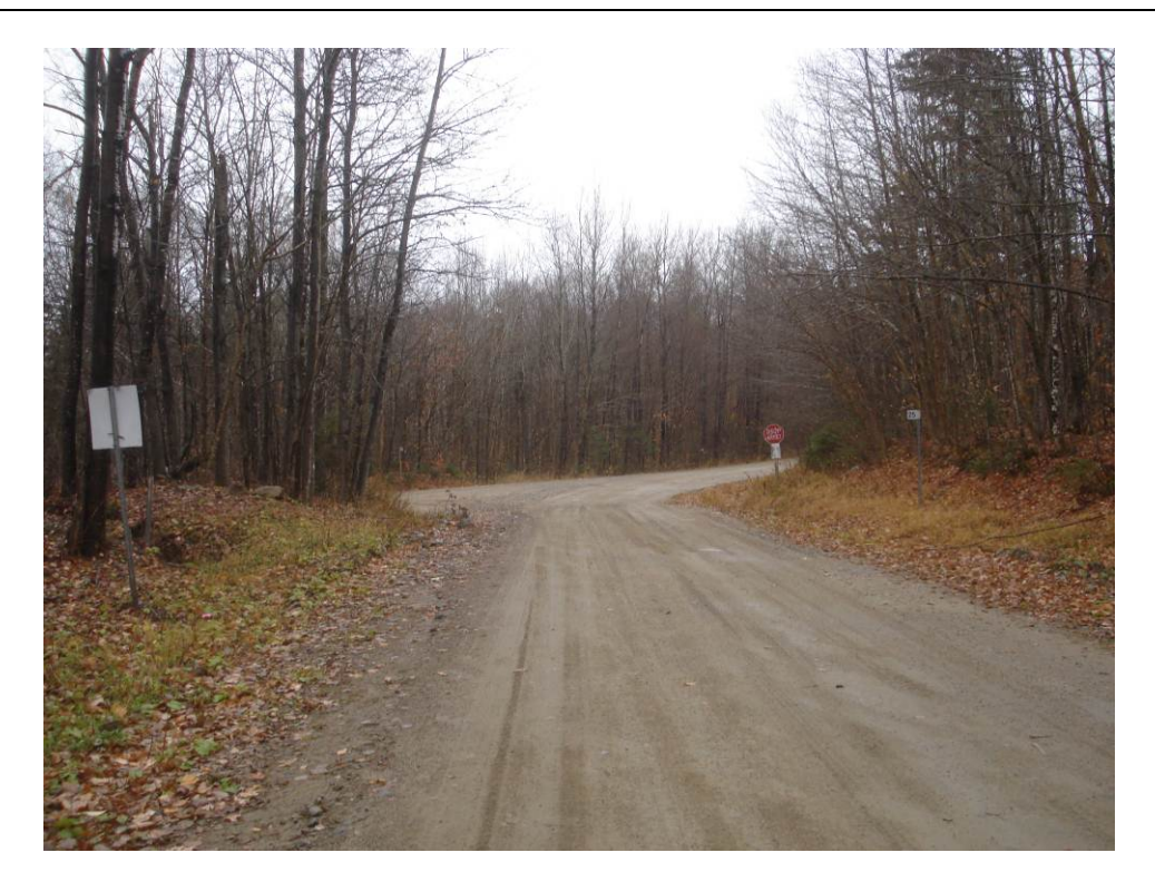
Photo 8.15.2 Fire Road, near the intersection with Napadogan Road, looking eastward.