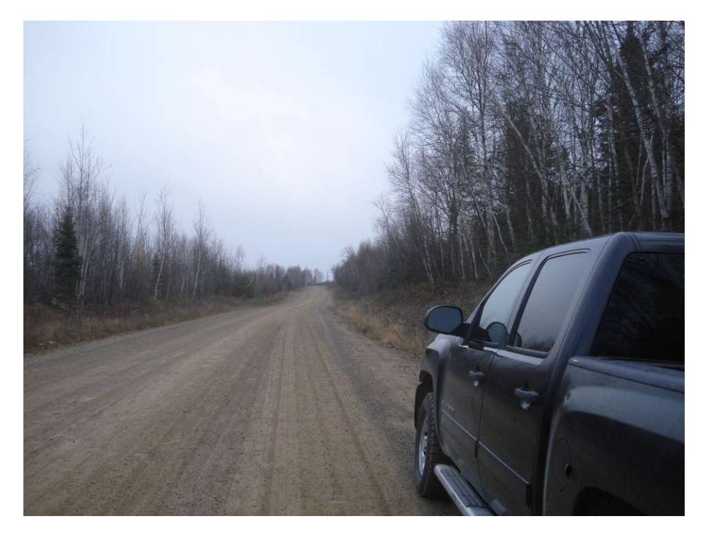
Photo 8.15.1 Napadogan Road (also known as Valley Forest Products Road), looking northward.

The design of forest roads is the responsibility of the Crown Timber Licence Holders and is reviewed and approved by NBDNR prior to construction. Design considerations for the construction and maintenance of forest roads, including watercourses crossings, is dependent upon expected loadings, vehicle dimensions, travel speeds, sight distances, and traffic densities that are anticipated to use the road, for the life of the road (NBDNR 2004). Maintenance of the forest roads ( e.g., grading, snow removal, and restoration and upgrading) is conducted by the Crown Timber Licence Holders and managed through on-going agreements among the Crown Timber Licence Holders in consultation with NBDNR. The level of road maintenance provided to segments and condition of the forest roads is generally dependent upon whether they are actively in use by the forest products industry (exp Services Inc. 2013a).