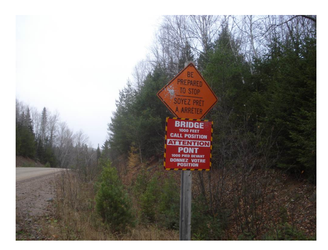
Photo 8.15.5 Warning sign near single-lane bridge on Four Mile Brook Road.