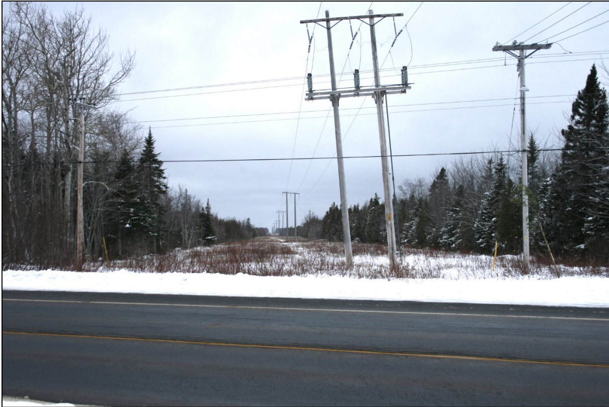
Photomontage 2: Highway 330 - 69kV line (Turbine #1 is blocked by trees to the right of the power line).