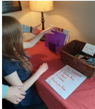
Partial Physical Assistance