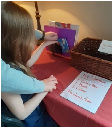
Full Physical Assistance

Gestural assistance is just what it sounds like - using gestures, such as pointing, to indicate what your child should do. Going back to the example of taking materials from the basket, you would simply point to the basket to encourage your child to take the needed materials.