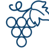
Wineries and distilleries