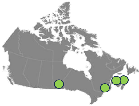
Locations with Bt resistant ECB populations in Canada