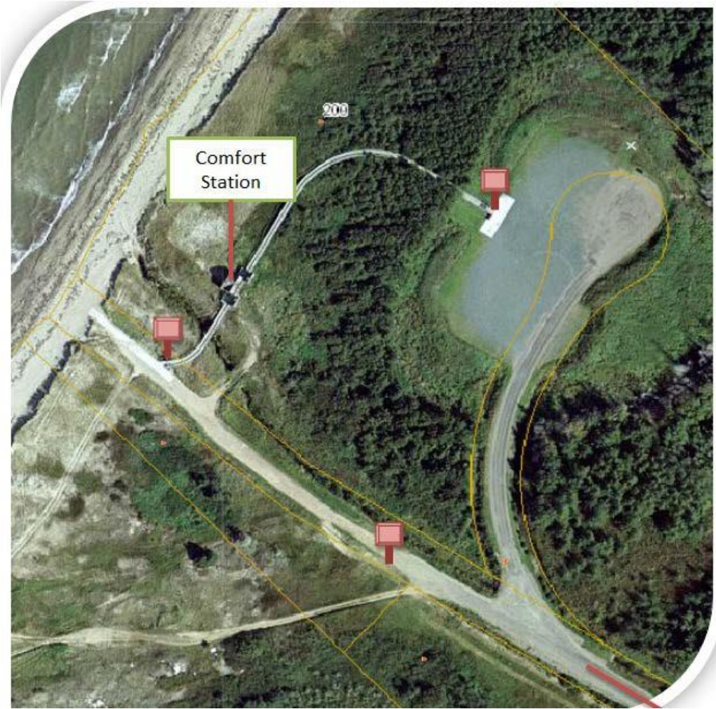
(Communication with the Department of Tourism, Heritage and Culture – February 2018)

Informative beach signs will be placed at the two (2) designated beach entrance points and at the Park Entrance, as illustrated below.