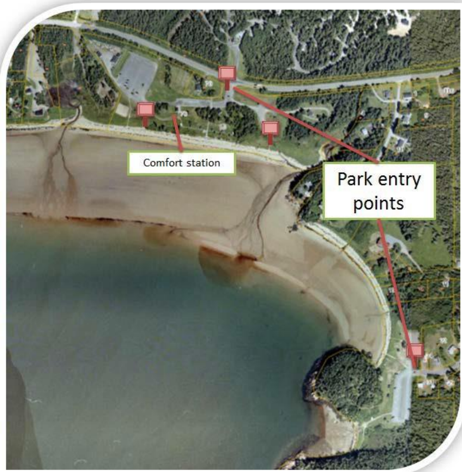
(Communication with the Department of Tourism, Heritage and Culture – February 2018)

Informative beach signs will be placed at the two (2) designated beach entrance points, and at the two (2) Park entrances, as illustrated below.