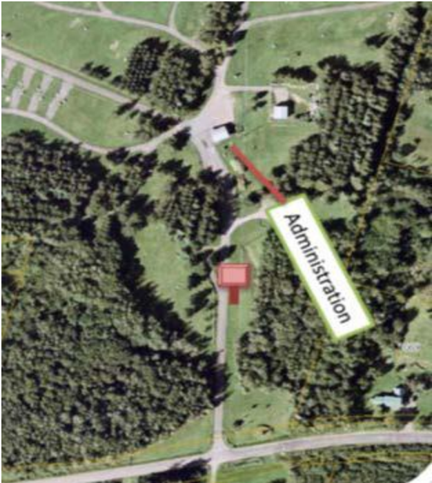
(Communication with the Department of Tourism, Heritage and Culture – February 2018)