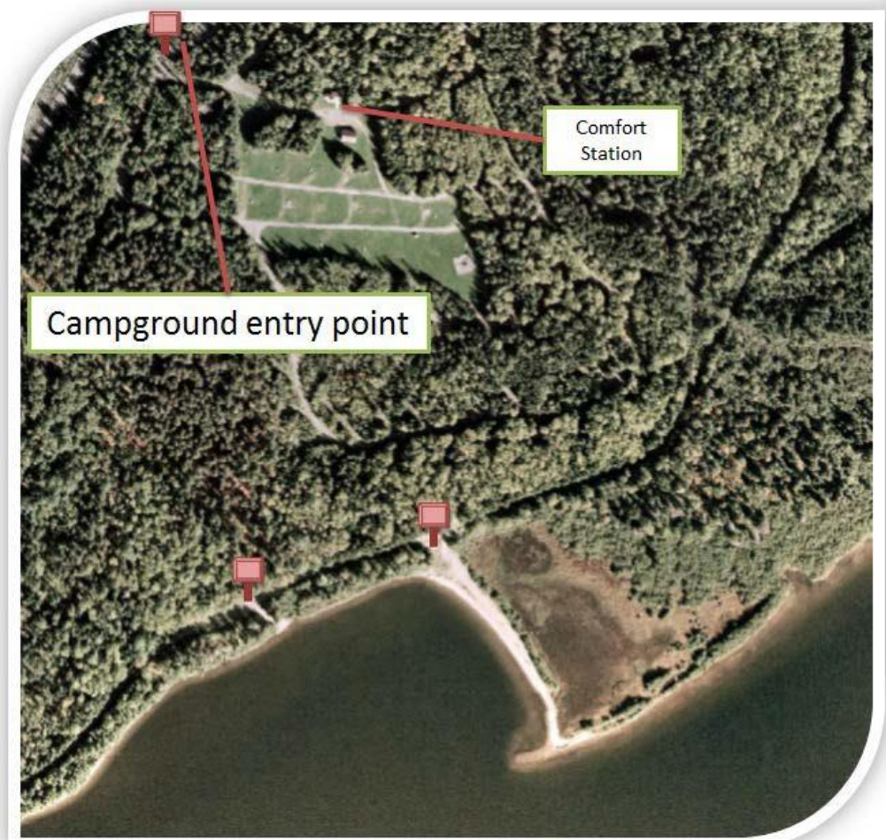
(Communication with the Department of Tourism, Heritage and Culture – February 2018)

Informative beach signs will be placed at the two (2) designated beach entrance points, and at the entrance to the campground, as illustrated below.