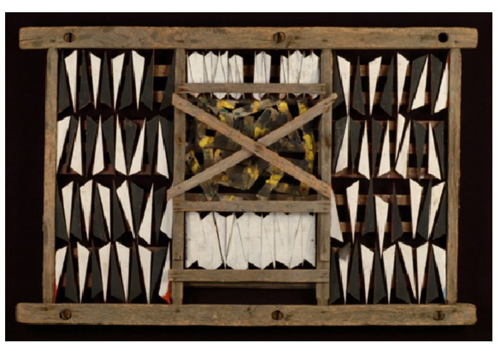
With Two Bows, Bernard Langlais, part of a 2008 cultural exchange exhibition between the Maine and New Brunswick