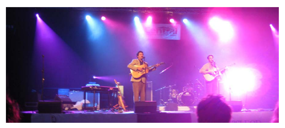
Petunia – The opening act of the 2010 Contact East Performing Arts Conference

An effort should be made to include business and tourism interests with this international initiative, to share what the cultural sector is doing, and to see how mutually beneficial projects can be initiated. Guidance and information should be provided to interested parties and support should be provided when innovative initiatives germinate from these other sectors.