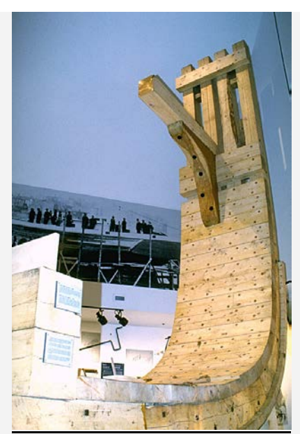
New Brunswick Museum, Saint John

The economic benefits are as compelling as the cultural gains that would come through strengthened arts policy between Maine and New Brunswick. The following recommendations seek to maximize the cultural, social and economic benefits from cross-border cultural opportunities.