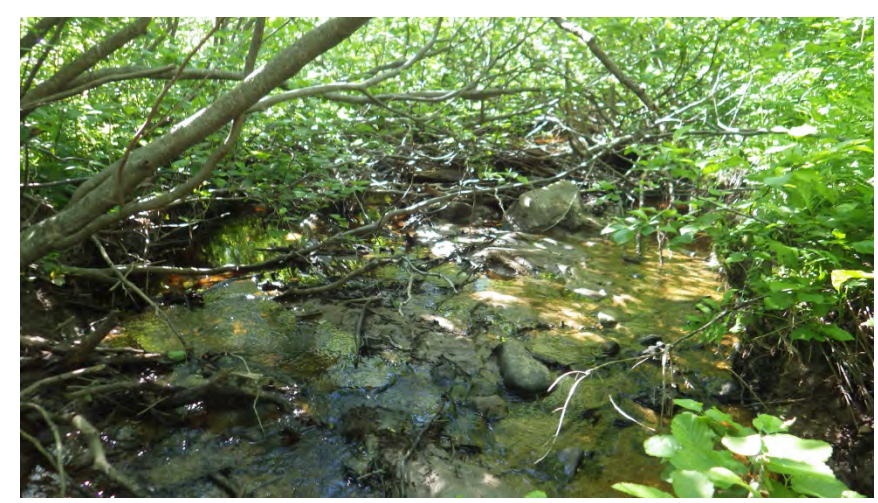
Typical habitat upstream and dowsntream of ROW.