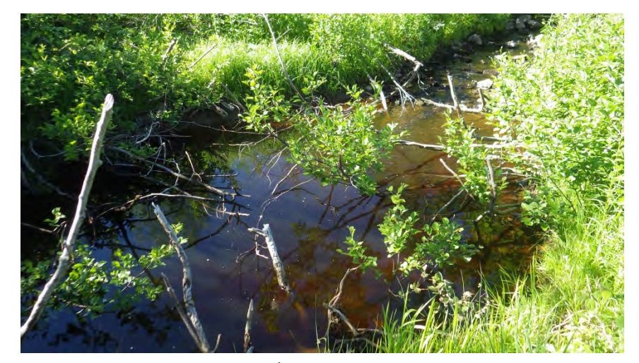
Habitat in ROW.