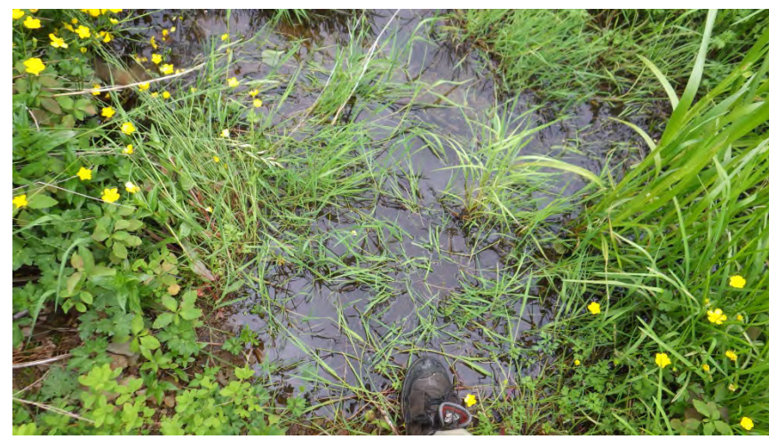
Habitat within ROW.