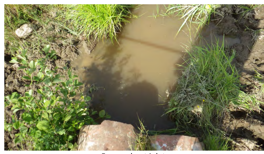
Farm culvert inlet.