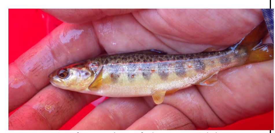
One of two age classes of salmon parr sampled.