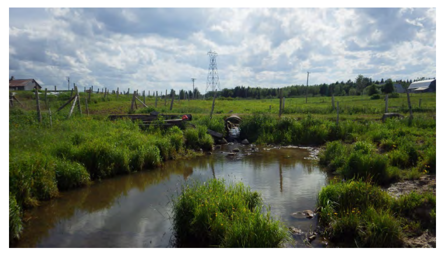
Habitat in area of farm lane culvert.