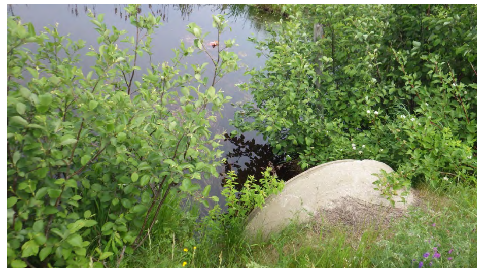
View of trail culvert inlet at downstream extent of marsh.