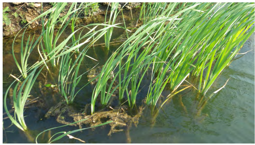
Vegetation in Borrow Pit Pond Drainage channel