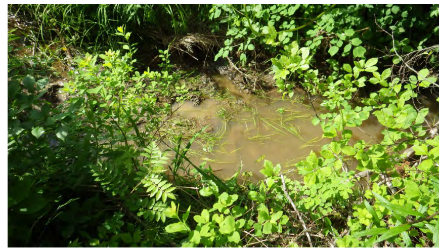
Channel downstream of farm culverte and in downstream extent of ROW.