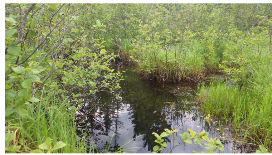
Habitat downstream extent of beaver pond