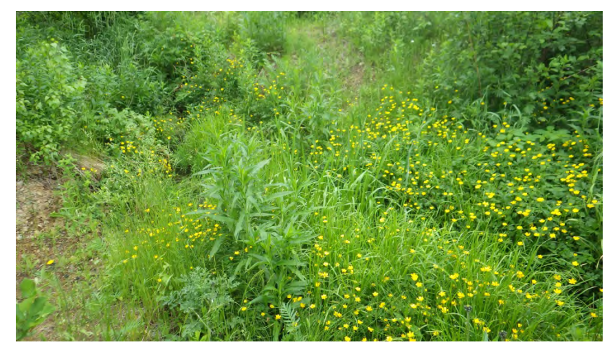
Habitat in downstream extent.