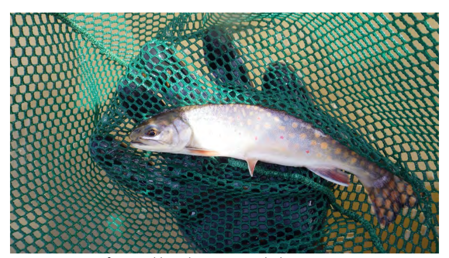
One of several brook trout sampled in watercourse.

Route 11 – Glenwood to Miramichi Bypass WC 4 (34+225)