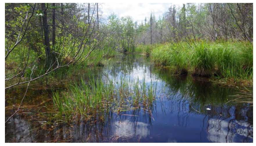
Beaver pond habitat in ROW.