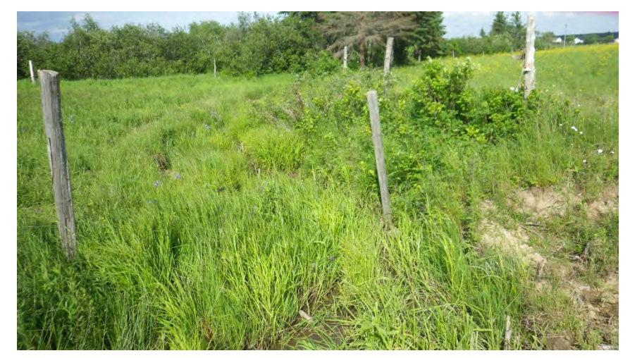
Drainage channel upstream of farm lane culvert.