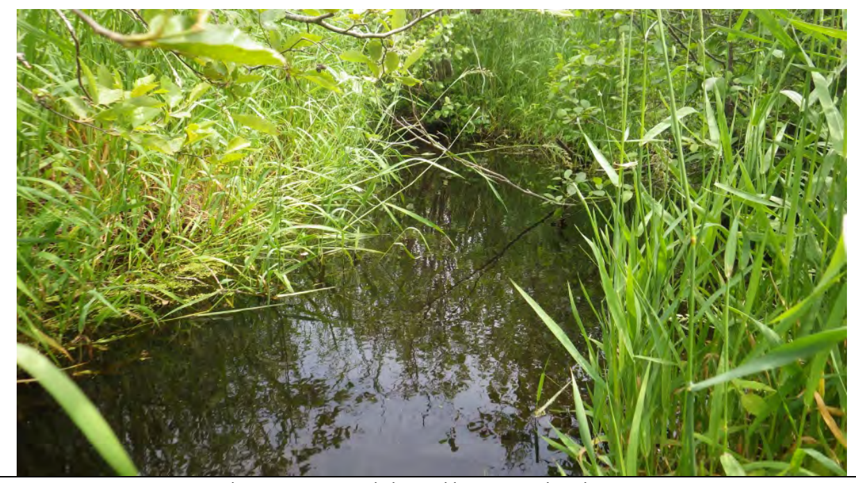
Habitat in excavated channel bottom within the ROW.

Route 11 – Glenwood to Miramichi Bypass WC 2 C (80+525)