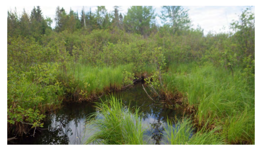
Beaver pond and wetland habitat in ROW.