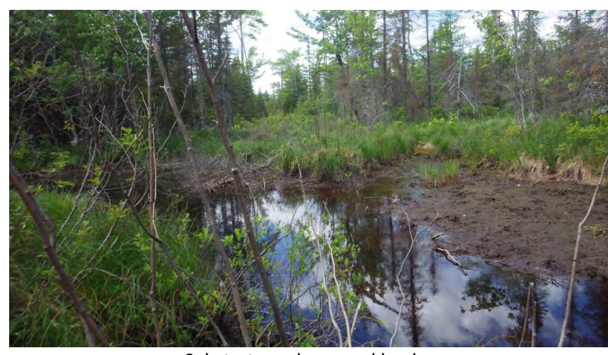
Substrate and exposed banks.