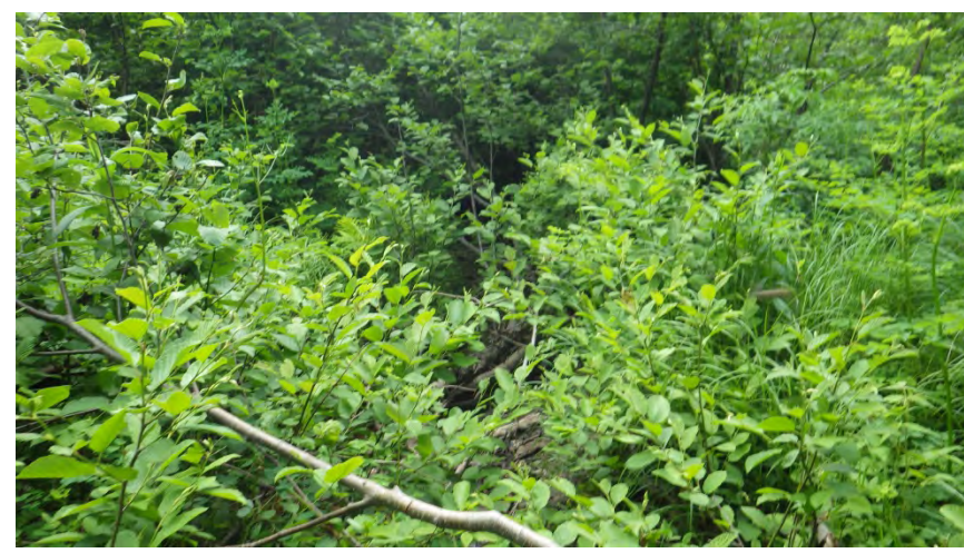
Typical upland vegetation in area of watercourse.