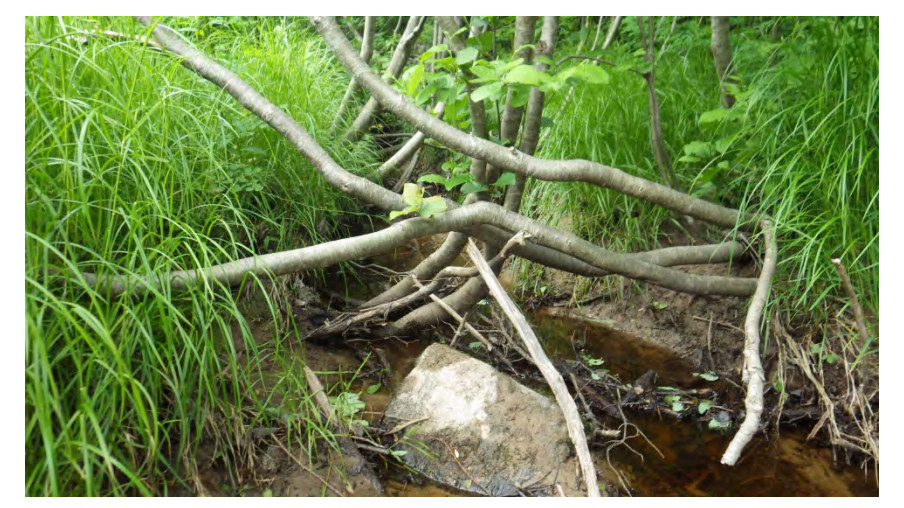
Habitat in ROW.