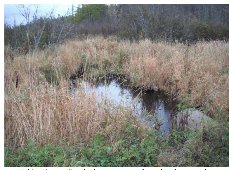
Habitat immediately downstream of trauk culvert outlet.