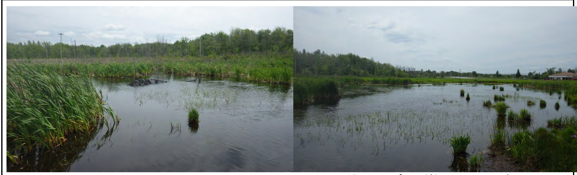
View towards east from within open water marsh