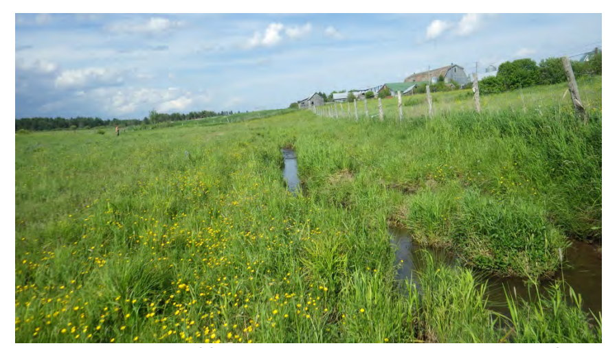
Channel downstream of farm culverte and in downstream extent of ROW.