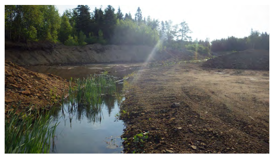
Drainage Channel to Borrow Pit Pond, facing upstream.