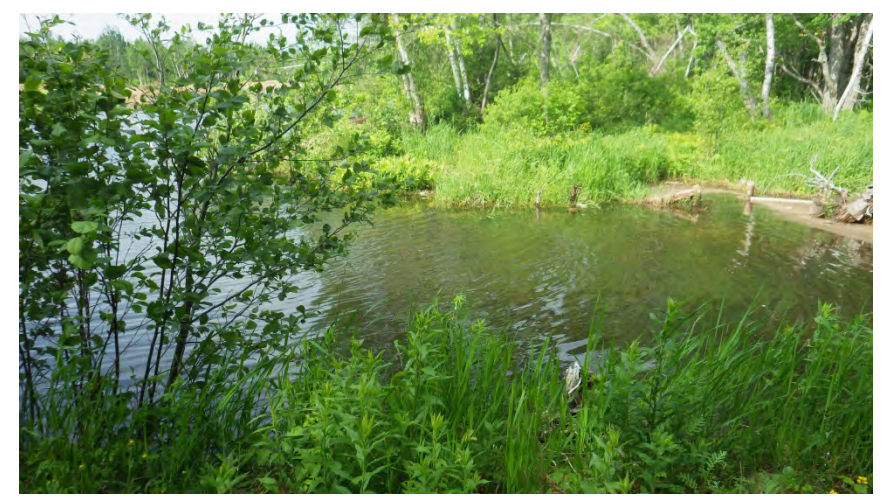
View of Borrow Pit in outlet area