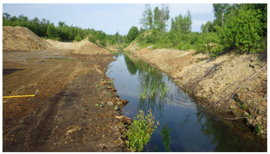
Drainage channel to Borrow Pit Pond, facing downstream.