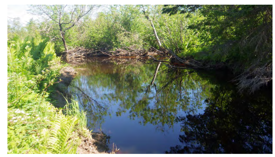
Habitat in ROW.