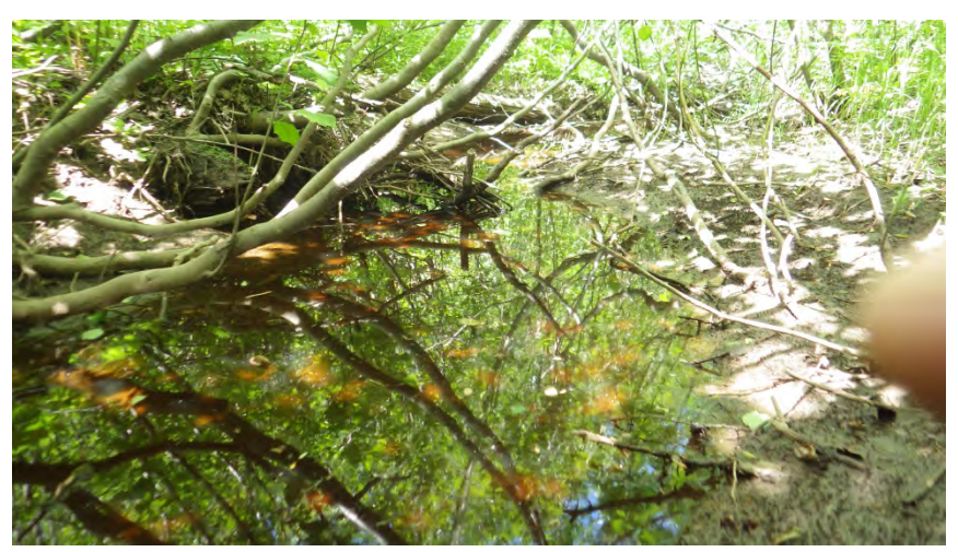
Habitat downstream of beaver pond