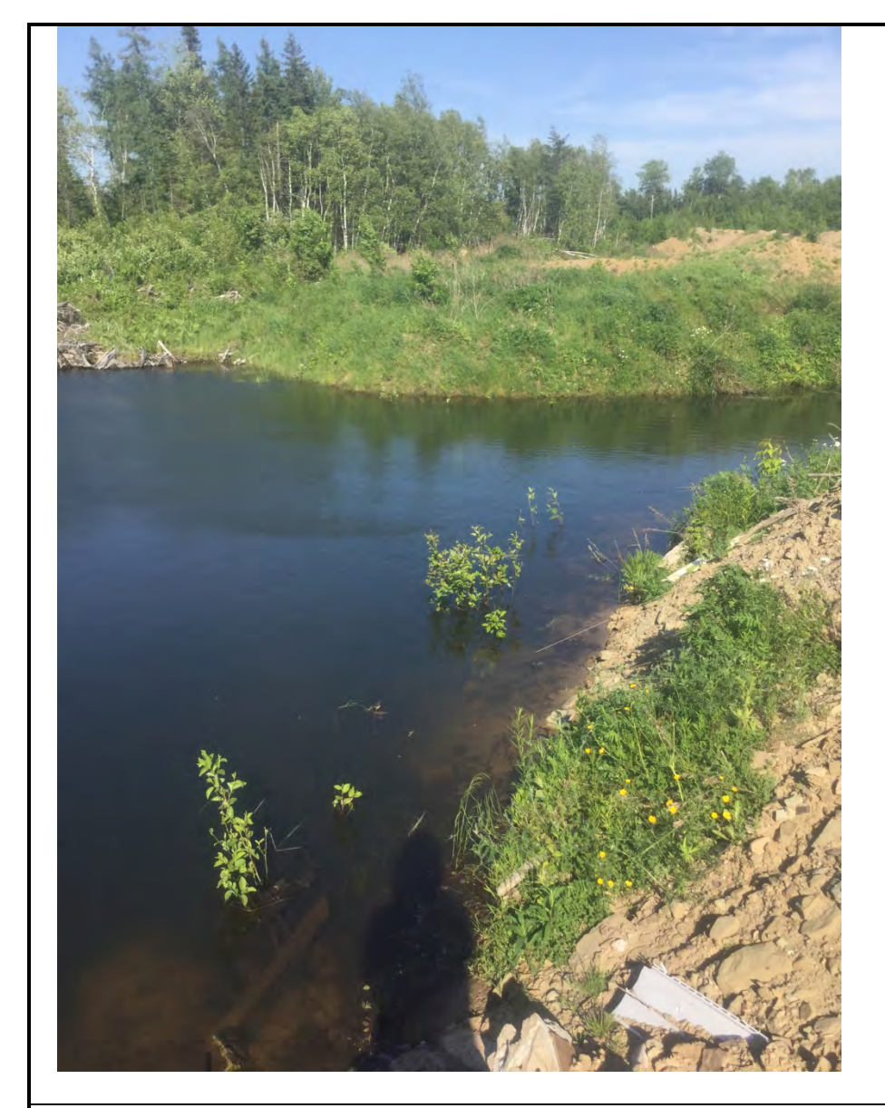
Western extent of Borrow Pit Pond facing west.