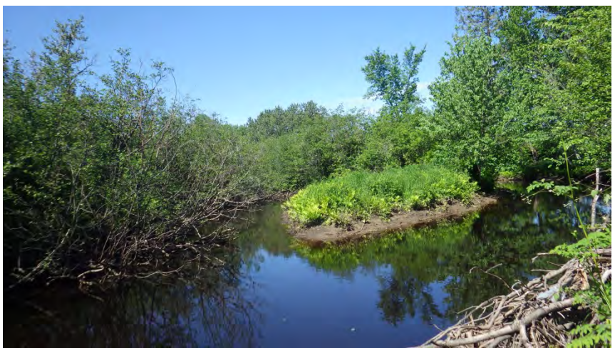
Habitat in upstream extent of ROW.