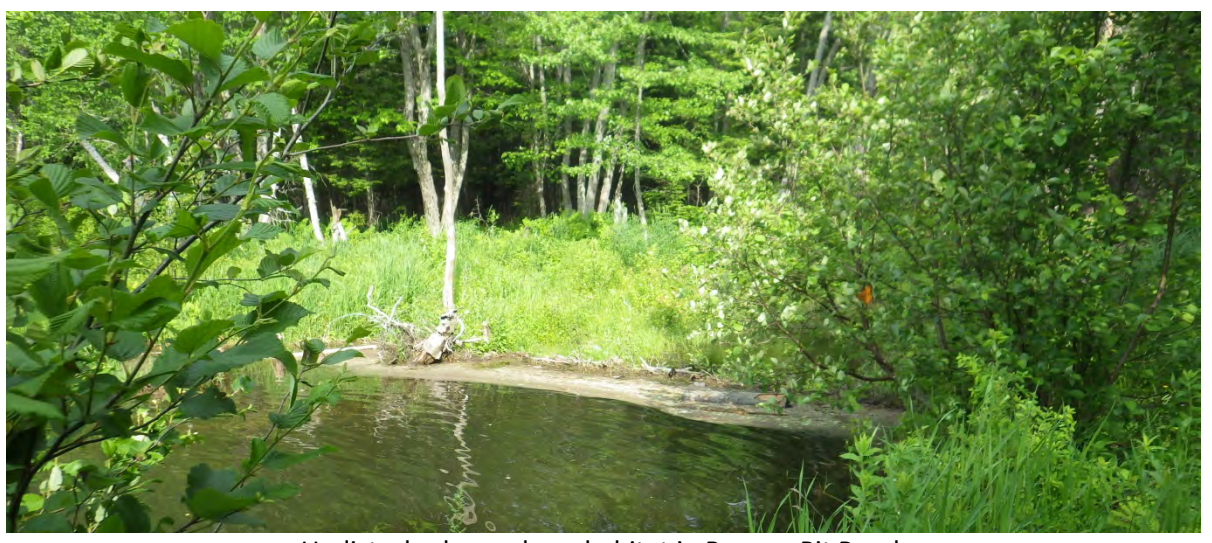
Undisturbed nearshore habitat in Borrow Pit Pond.