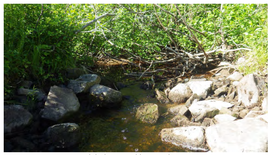
Bank habitat and large substrate.