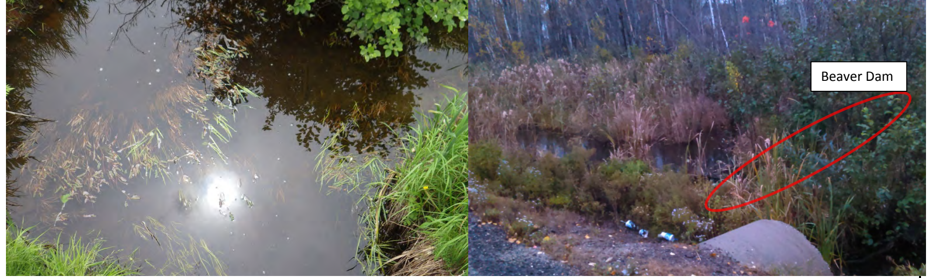
View of aquatic vedgetation in ROW.