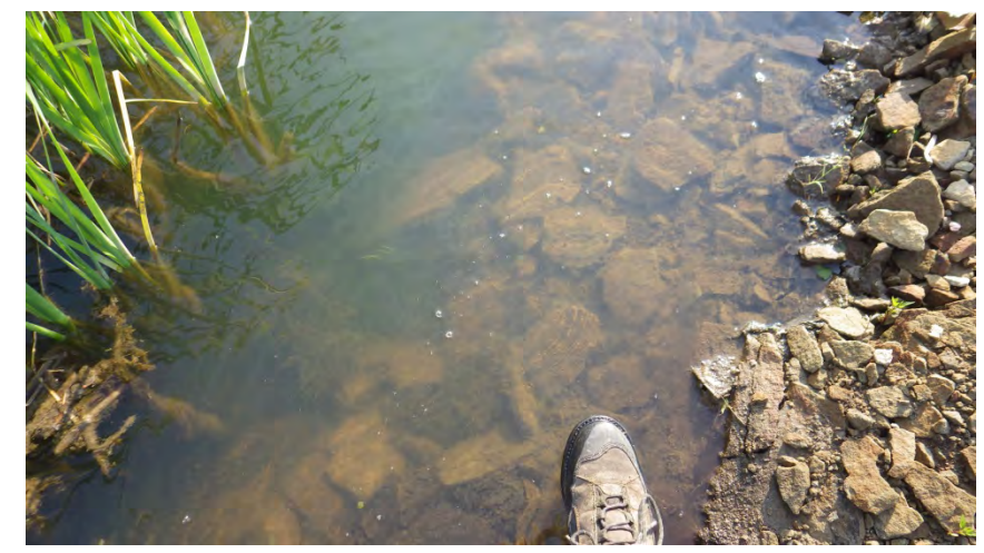
Habitat upstream of Route 11 with beaver dam and ponded area.

Route 11 – Glenwood to Miramichi Bypass WC 2 D (31+700, 300+480, 200+550), 2 E (80+630) and 2 F (31+850, 200+700, 80+840)