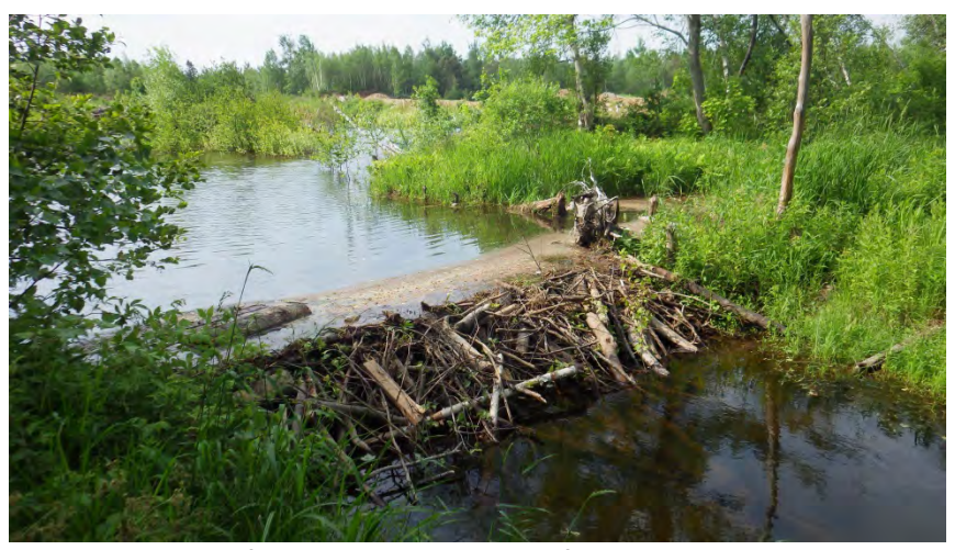
View of beaver dam at outelt of Borrow Pit Pond.