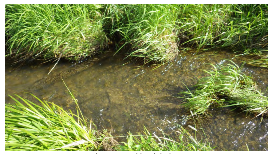
Substrate and bank habitat