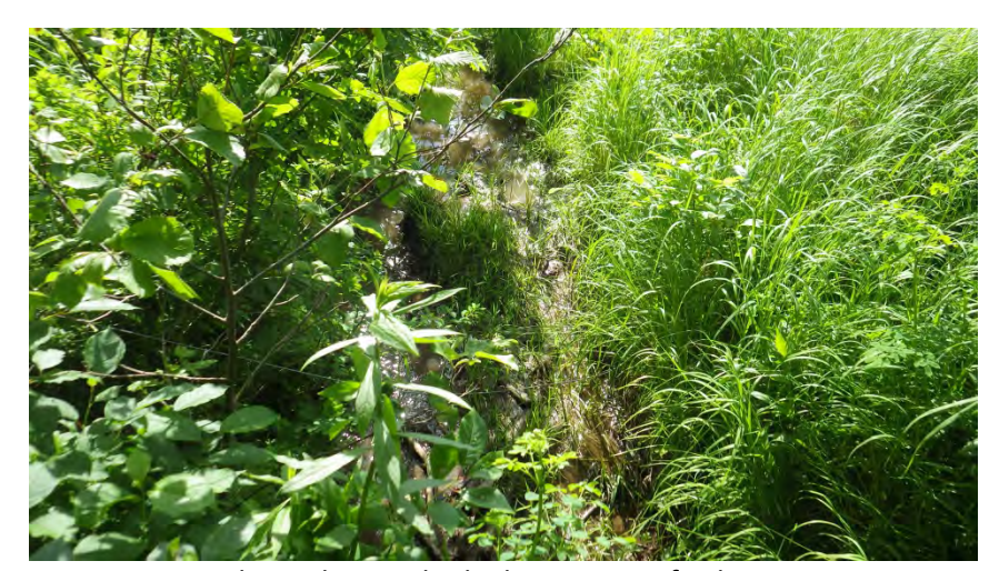
Channel immediatly dowstream of culvert.