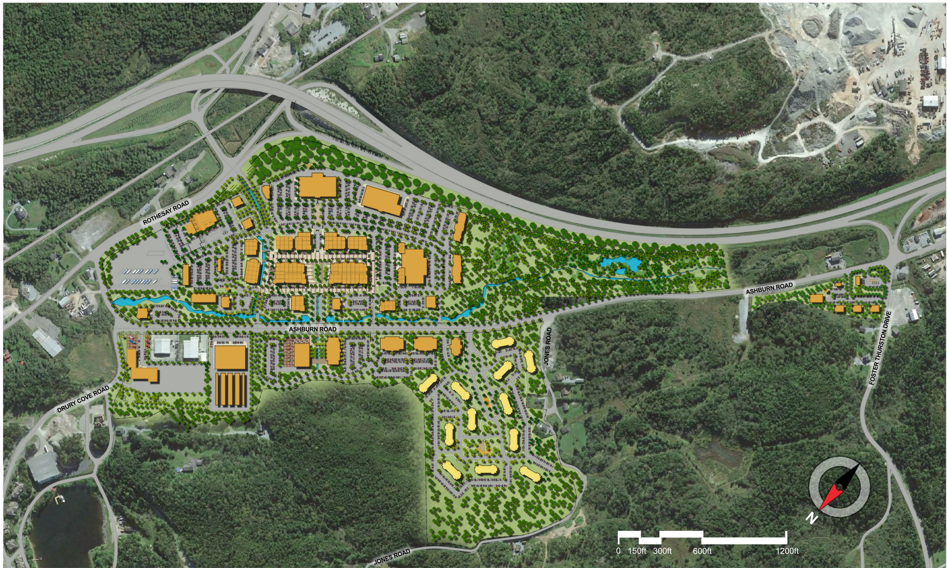
Figure 1 - Revised Conceptual Rendering of the Developed Site Plan